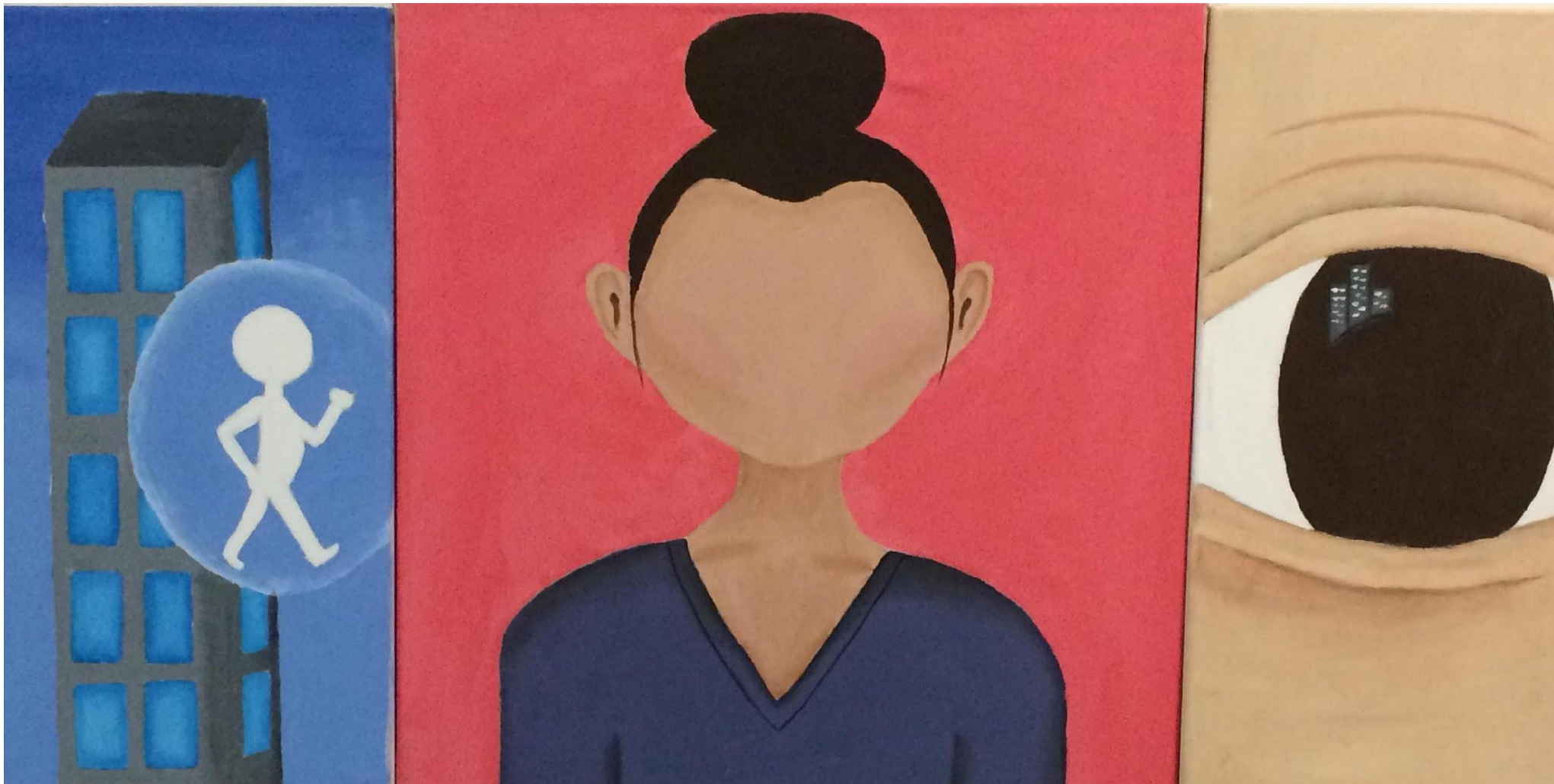
Artist in the City, Artist, City in the Artist. 60.96x121.92 cm. Acrylic on canvas.

The original intention for this piece was to create each canvas representing me as the artist, the artist in the city and the city in me using symbolism. My intention was for the audience to analyze the piece and understand how I felt about myself as an artist, the artist in the city and how I see the city in myself. The medium that was used was acrylic on canvas.