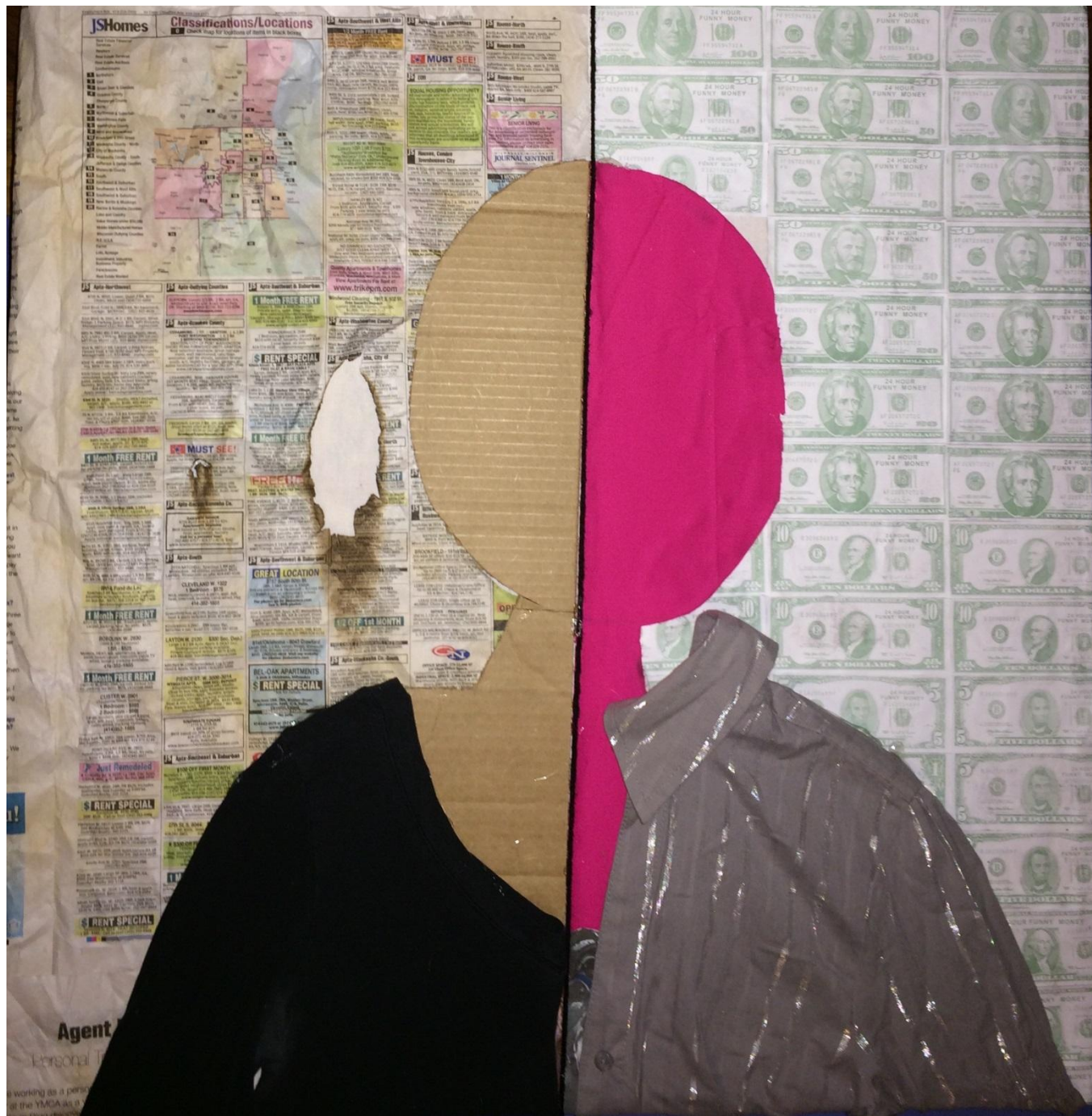
Mixed Media. 60.96x60.96 cm. Mixed Media.

The original intention of this piece was to use several different objects to emphasize the difference in two types of stereotypes. This piece was inspired by Conrad Marca-Relli's abstract expressionism collages. The medium used for this piece was mixed media because found objects were used.